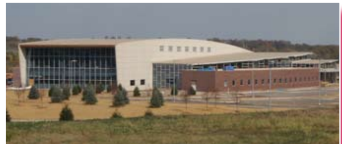
The Community Tissue Services facility at Miami Valley Research Park.

The state-of-the-art facility represents a $40 million investment to Kettering, but you could say that it represents much more. The decision to build the facility at the Miami Valley Research Park was a significant boost to the City at a critical time.