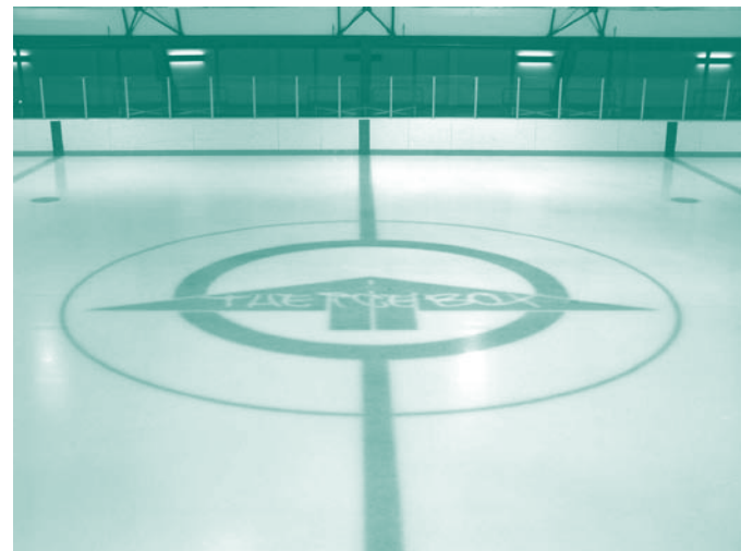
The Ice Box at the Kettering Recreation Complex